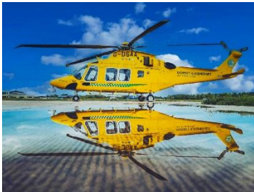
Des Curtis – ‘The Dorset and Somerset Air Ambulance’